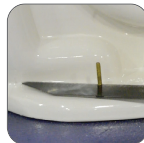
S49030 Cuts iron, copper, brass, aluminum, and other metals