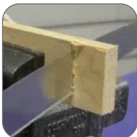
S49005 & S49008 Cuts plastic pipe and wood